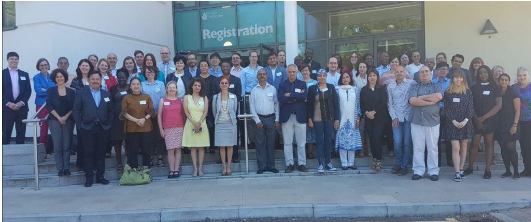
Office for National Statistics, UK

UN Women, UN Dept of Economic and Social Affairs, UN Population Fund, UN Habitat, UN Development Programme, World Health Organisation