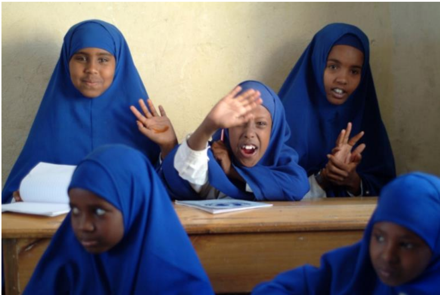
SchülerInnen der Hargeisa Deaf School, Somalia.

Do you want to be informed or engage? Please, contact us.